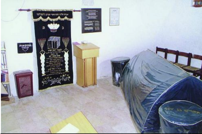
Tomb of Joseph in Israel

27 By faith he forsook Egypt, not fearing the wrath of the king; for he endured as seeing Him